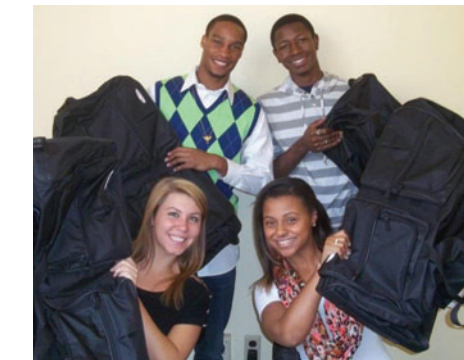
SHIP participants receive duffle bags.