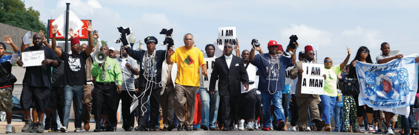
PROTESTORS RALLY OUTSIDE OF THE FERGUSON POLICE DEPARTMENT ON AUGUST 11, 2014.