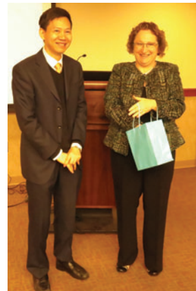
ILLUSTRATION: ERIC MILLER

Dr. Deng detailed how a new social class of wealthy people has emerged in China, with a 2.3 fold increase in five years of individuals with $1.64 million or more in assets. Most charitable giving in China has followed in close relationship to how the government views philanthropy. Before 1978, the Chinese government viewed charitable giving as a negative, making private donations impossible. The attitude relaxed through 1994, and now the Chinese government has progressed to positive encouragement of individuals and corporations for setting up charitable foundations. ■