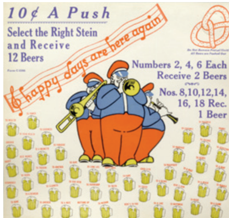
Source: Push-tab punchcard ca 1950s