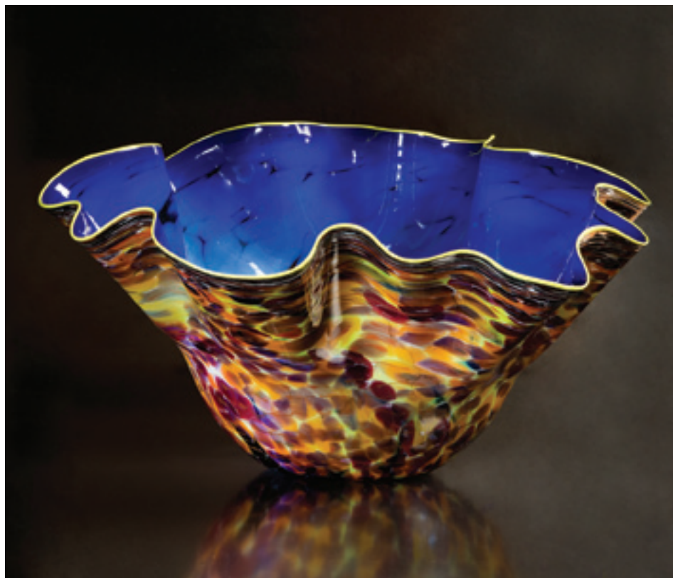
"A Gift in Honor of Tyler Clementi," on display at the Zimmerli Art Museum through July 31, 2014.