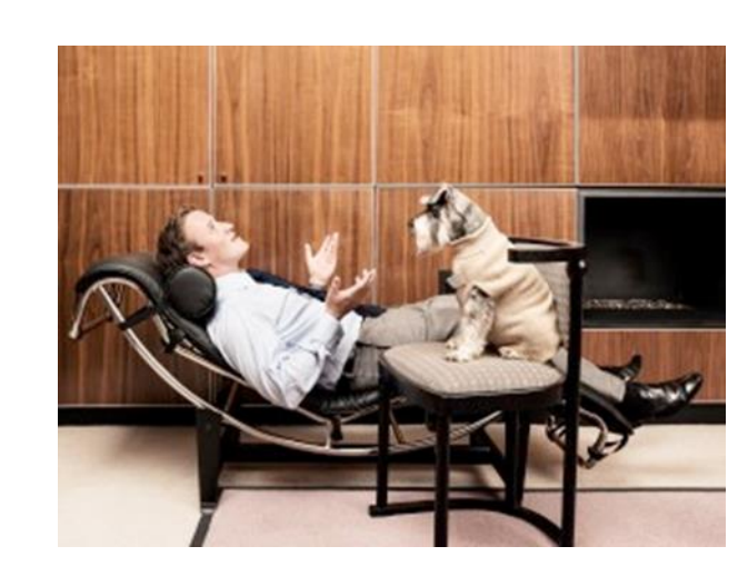
Couples Counseling, San Diego