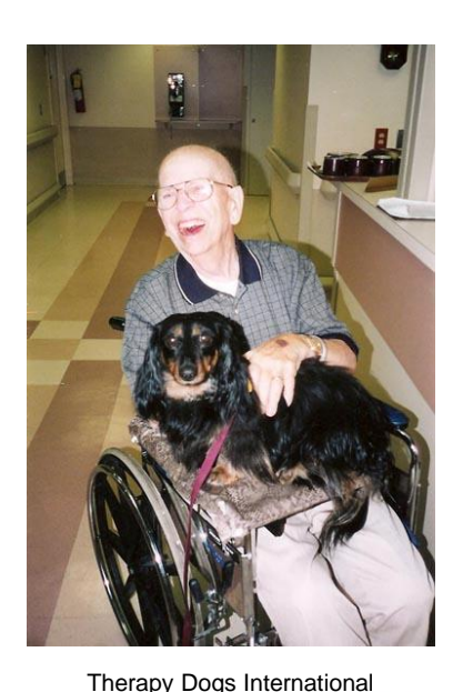
Intermountain Therapy Animals